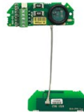
X24-SAe ATEX / IECEx Telemetry Load Cell Transmitter OEM Module