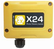
X24-ACMi-SA ATEX / IECEx Telemetry Load Cell Transmitter Module